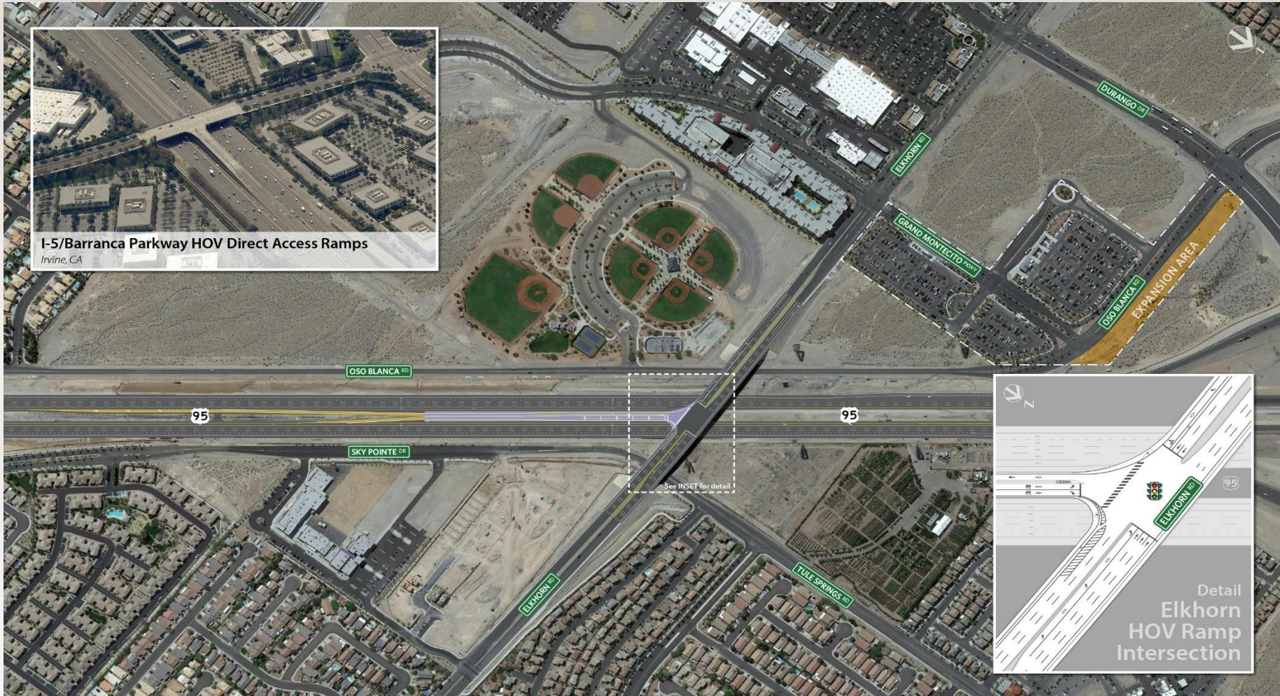
I-5/Barranca Parkway HOV Direct Access Ramps Irvine, CA