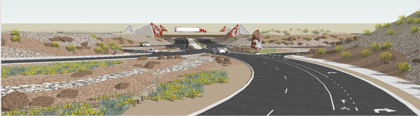
Perspective | View of New US 95 Bridge at Kyle Canyon Underpass