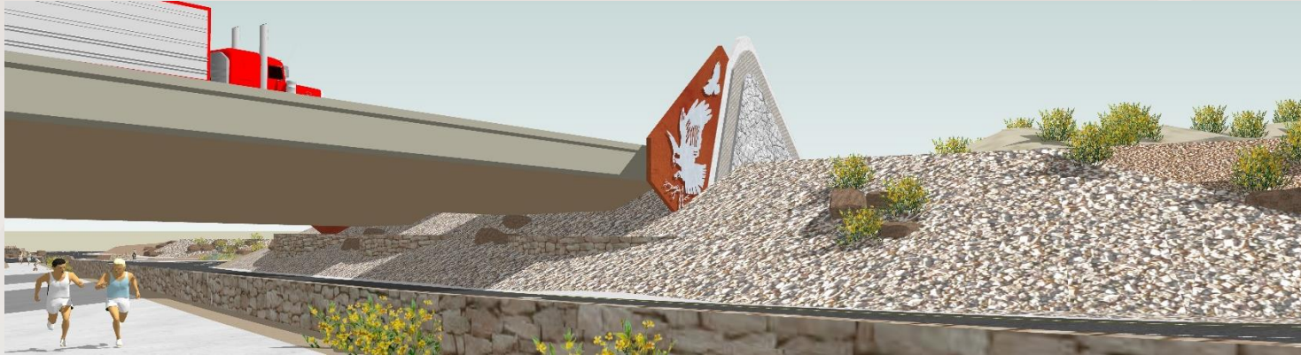
Perspective | View of New US 95 Bridge at Kyle Canyon Underpass