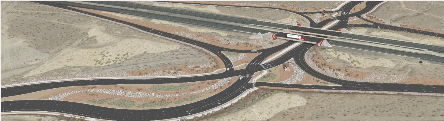
Bird's Eye Perspective | View Northwest Kyle Canyon Drive

All information presented is preliminary and subject to revision.