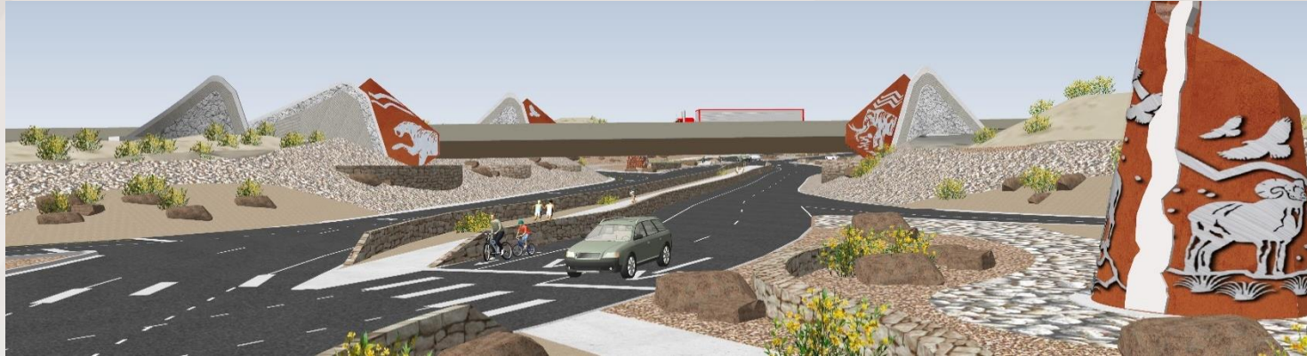
Perspective | View of New US 95 Bridge at Kyle Canyon Underpass