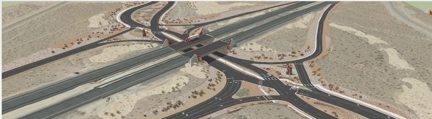
Bird's Eye Perspective | View Northwest Kyle Canyon Drive

All information presented is preliminary and subject to revision.