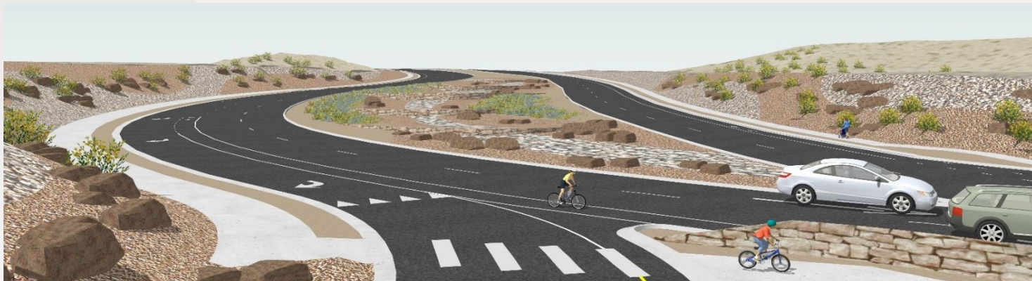
Bird's Eye Perspective | View West Kyle Canyon Drive

All information presented is preliminary and subject to revision.