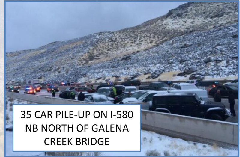
35 CAR PILE-UP ON I-580 NB NORTH OF GALENA CREEK BRIDGE