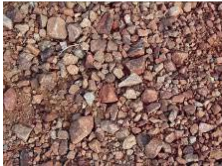
Example of ground treatment