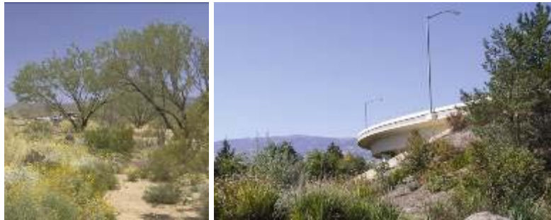
Examples of regionally adapted treatment