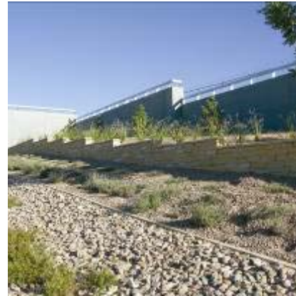
Example of focal treatment