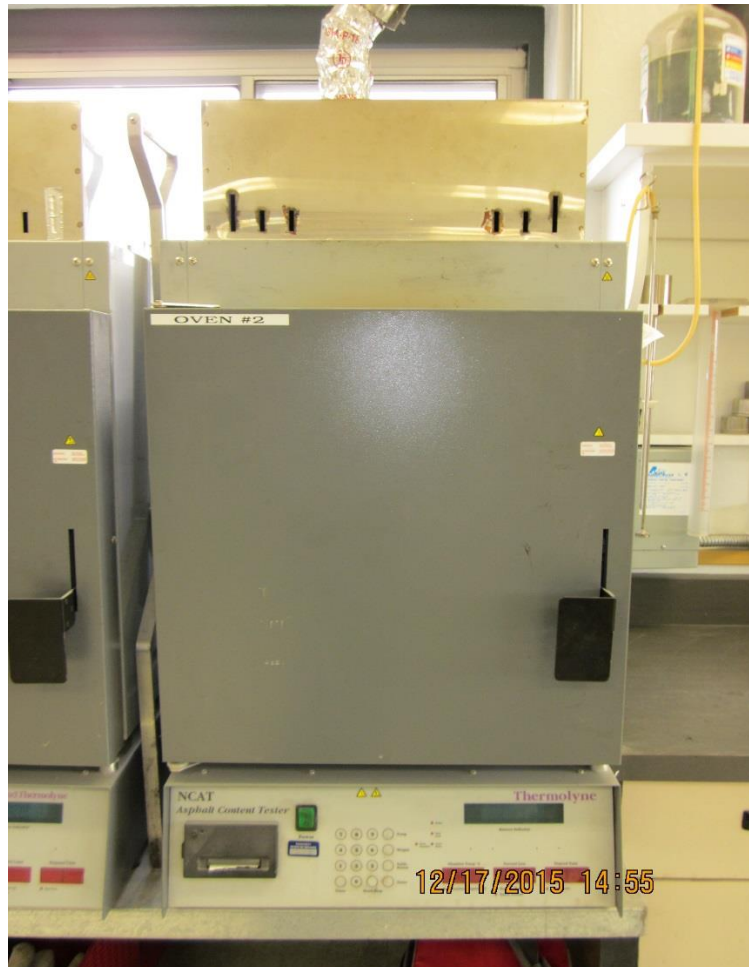
Figure 1 Furnace

B.R. shall be reported to the nearest 0.01 on the appropriate NDOT form and to the nearest 0.1 on appropriate NDOT coversheet form.