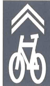
Guide for the development of bicycle facilities, 2013-fourth Edition

All information presented is preliminary and subject to revision.