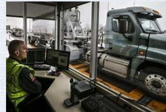
Fixed Site Inspection Moving weight system Allows moving visual equipment inspection