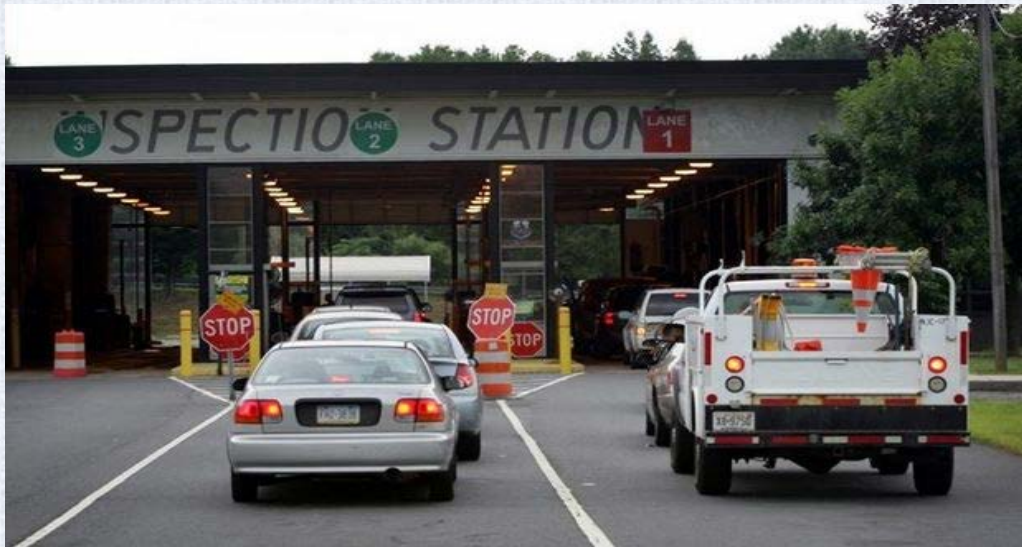
Every Vehicle stops