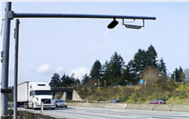
Advance Detection Legal-pass, Not Legal-pull in