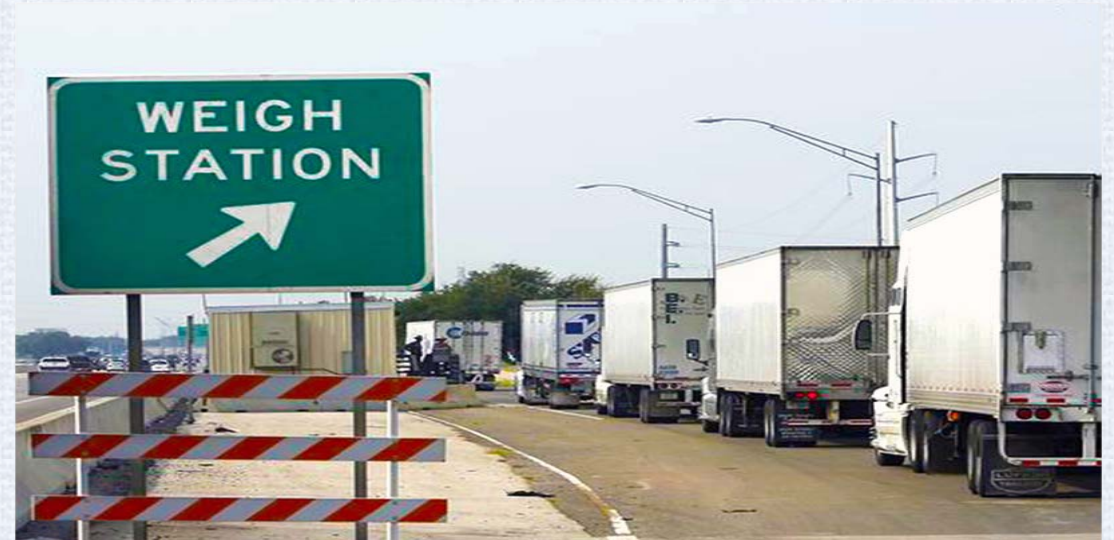
Only Commercial Vehicles stopped