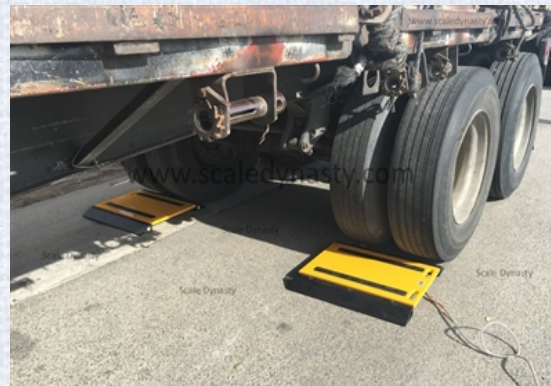
Portable Scales One truck at a time -all stop