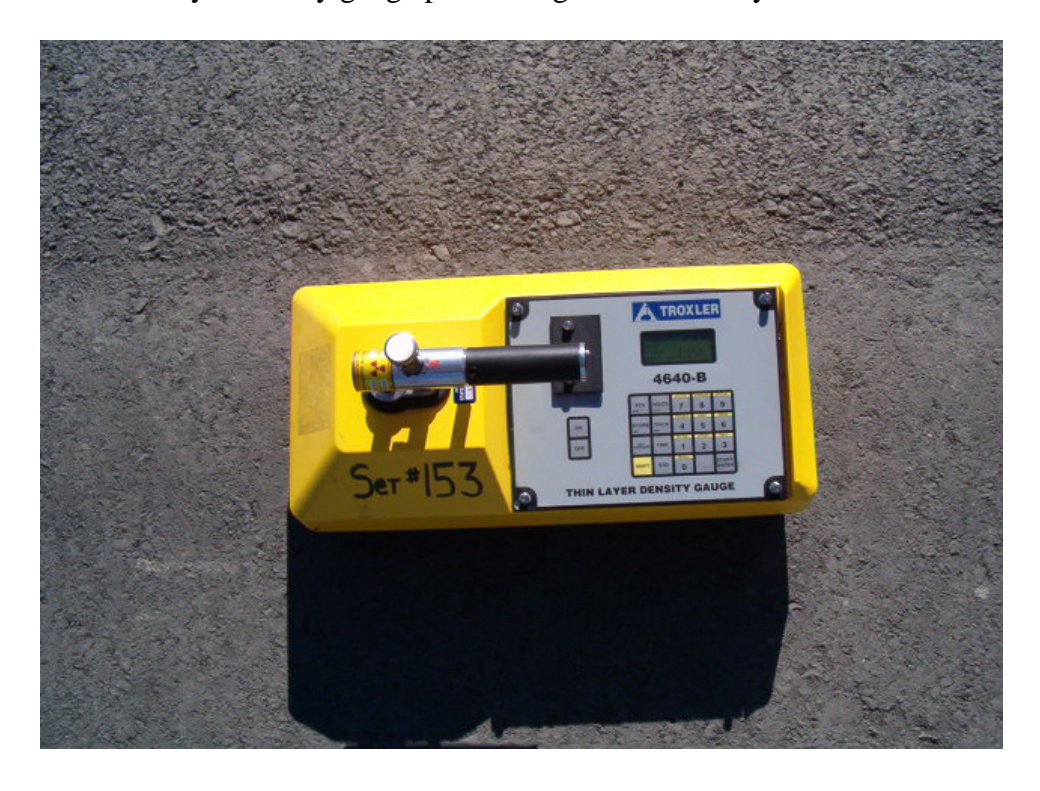
Thin layer density gauge positioning for one joint density test location.