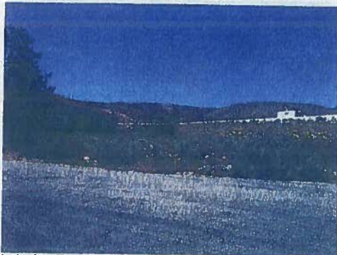
Northerly view from Hospitality Way toward the subject & I-580 with Hampton Inn to the left