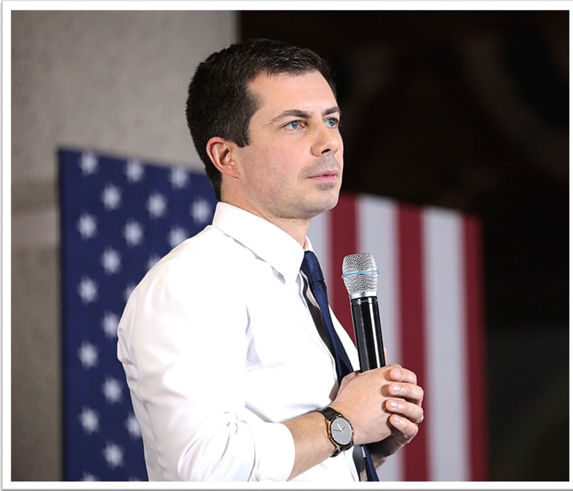
Pete Buttigieg 19 th Secretary of the U.S. Department of Transportation