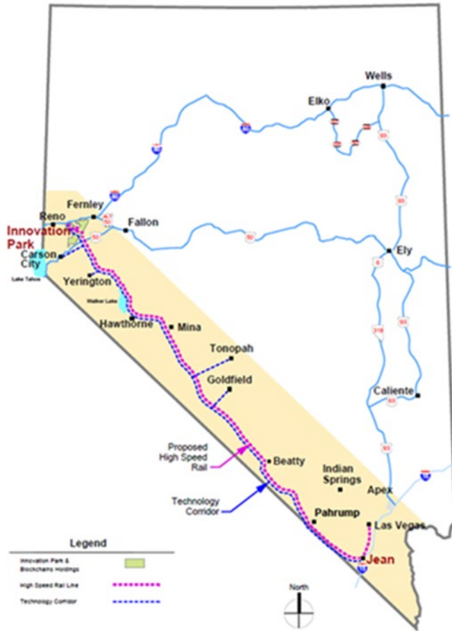
Nevada Technology Corridor -Exhibit B

Copyright 2020 RBDGlobal Advisors, LLC All Rights Reserved