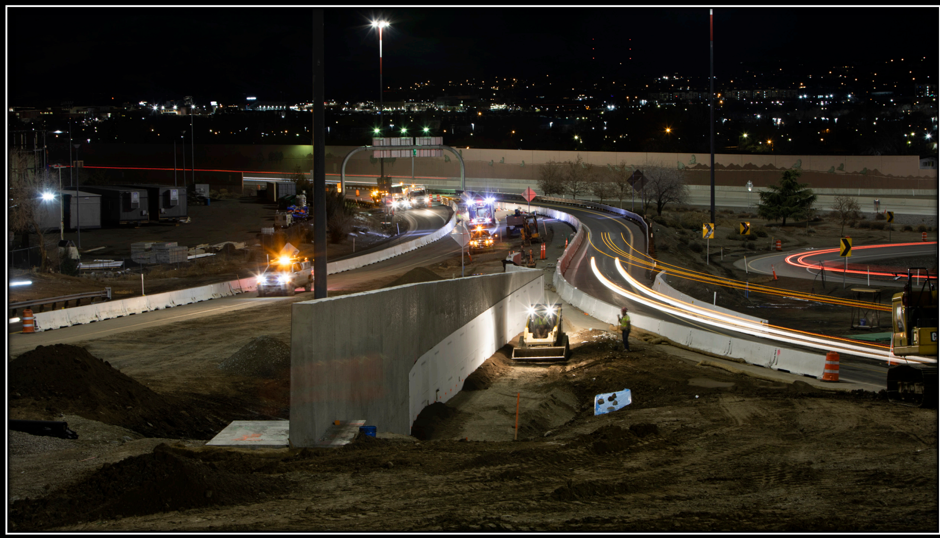
Crews work overnight to complete SBX, the first phase of the Reno Spaghetti Bowl Project.