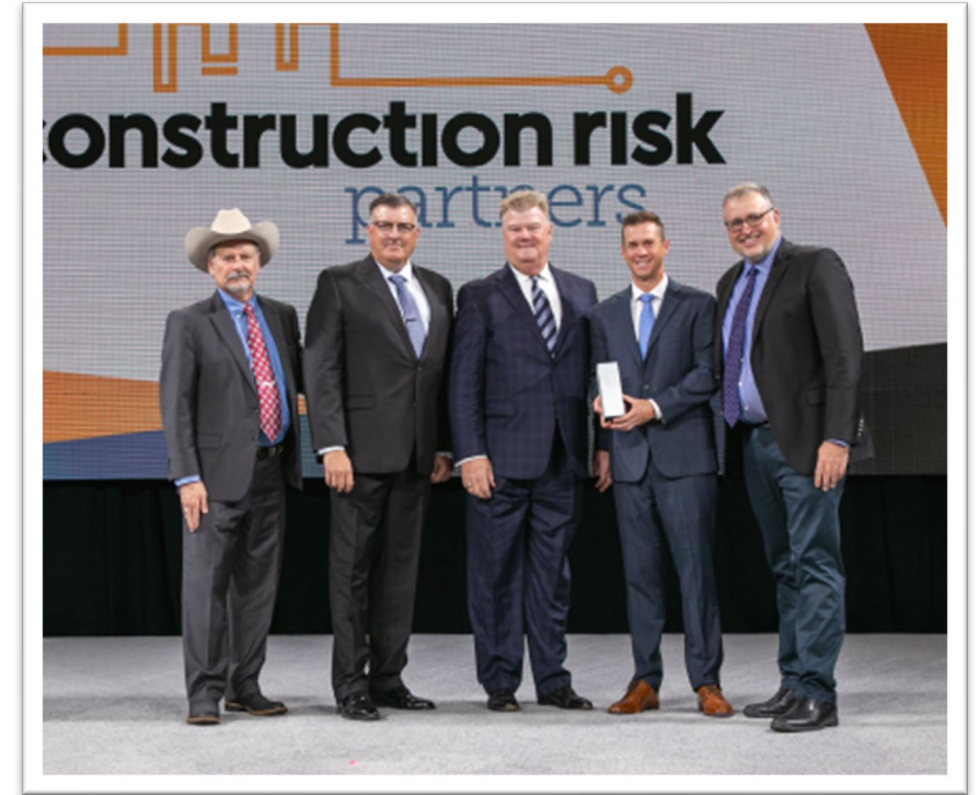
Kiewit and NDOT