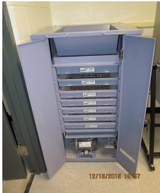
Figure 4 Large Test Master – Mechanical Shaker