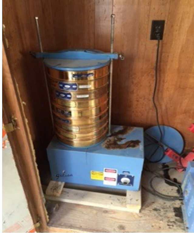
Figure 3 12" Gilson – Mechanical Shaker