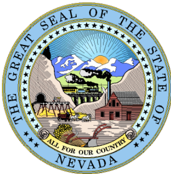
Kenny C. Guinn, Governor