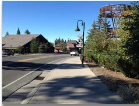
Crystal Bay Pedestrian Improvements

Transportation Alternatives Program Nevada Department of Transportation 1263 S. Stewart Street, Rm 205 Carson City, NV 89712 (775) 888-7124