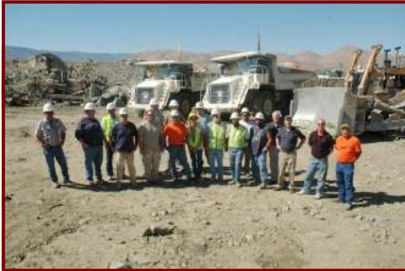
Carson City Airport—2008

The following are the companies and how many employees they had working on the Carson City Airport Project that was partially funded by the Nevada Aviation Trust Fund .