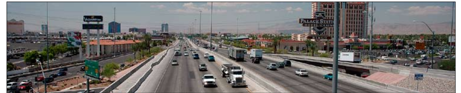
A federal commission recently met in Las Vegas to discuss creative ways to keep freeway traffic, and funding, running smoothly in the future.

The national transportation spotlight recently focused on Nevada with a Las Vegas hearing of the National Surface Transportation Policy and Revenue Study Commission to discuss vital transportation issues.