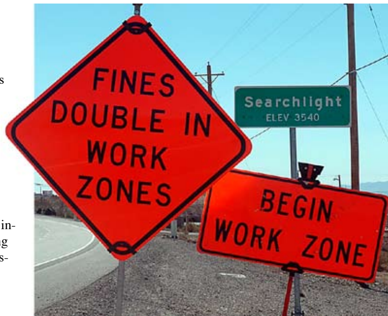
Searchlight road improvements will improve travel for trucks and passenger vehicles.