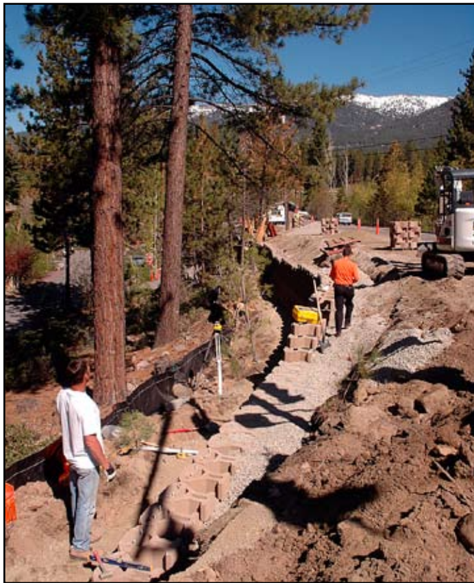
Lake Tahoe area roads underwent improvements last year.