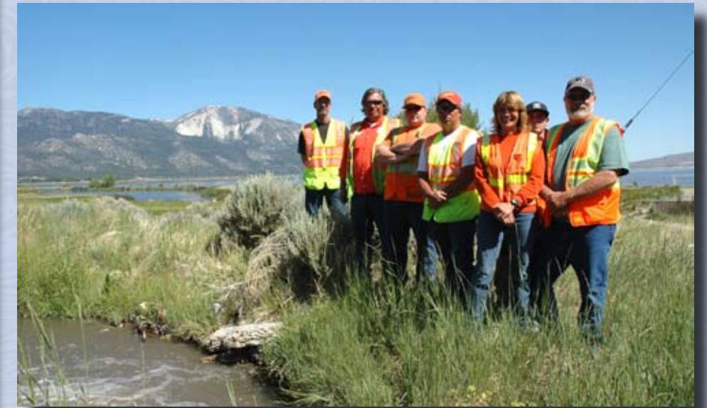
Above, Crew 270 proudly stands in the Washoe Valley Wetlands.

On the edge of Washoe Lake between Reno and Carson City lies a wetlands mitigation area that is a growing tribute to the work of some dedicated NDOT employees.