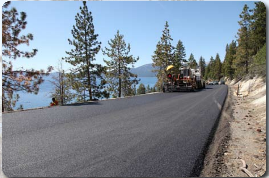
Scenic Lake Tahoe is the perfect backdrop for a near-completed State Route 28 project as pictured in late May.