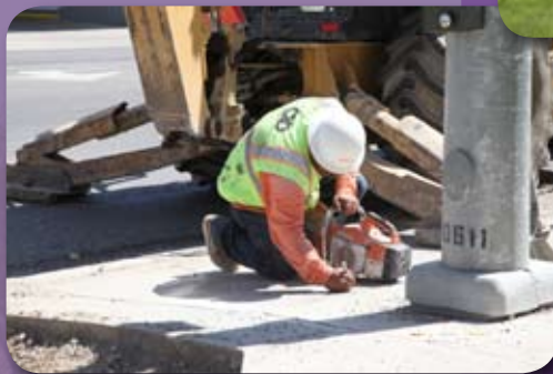
Workers improve walkway ramps as part of NDOT's Winnemucca-area recovery project.