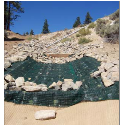
Typical channel test section after channel stabilization and installation of channel lining

Field-testing will enable the performance of RECPs to be monitored under actual field conditions during the winter and spring months when the majority of the runoff events occur. Test plots have been constructed in a channel within the Clear Creek watershed that has experienced severe erosion. Each field plot is 25-feet long and is preceded with a drop structure to reduce the extreme slope of the channel. The two-foot high drop structures were constructed using treated timber. A five-foot riprap apron was placed below each drop structure to dissipate energy at the upstream end of each test section. The riprap aprons also act as an anchoring device to secure the leading edge of the RECPs. The field performance of four different RECPs is being evaluated.