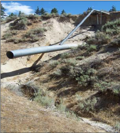
Uncontrolled erosion at culvert outlet

Severe erosion is occurring at several locations in the Clear Creek watershed along U.S. Highway 50 between Carson City and Lake Tahoe. Surface water runoff from seasonal snowmelt and infrequent high intensity rain events causes erosion resulting in the transport of substantial quantities of soil and sediment. Erosion has caused problems related to slope stability along roadways and increased maintenance requirements, especially those associated with drainage structures.