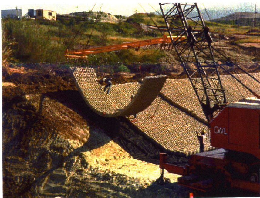
Armorflex mats installation with lifting beam

Cellular mats, or articulated concrete block revetment systems (ACB's), provide a flexible alternative to riprap, gabions and rigid revetments. These systems consist of preformed units, which interlock, are held together by steel rods or cables, or abut together to form a continuous blanket or mat to produce an erosion resistant