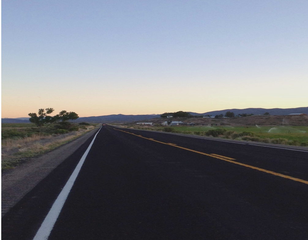
Rural Highway, Caliente, Nevada