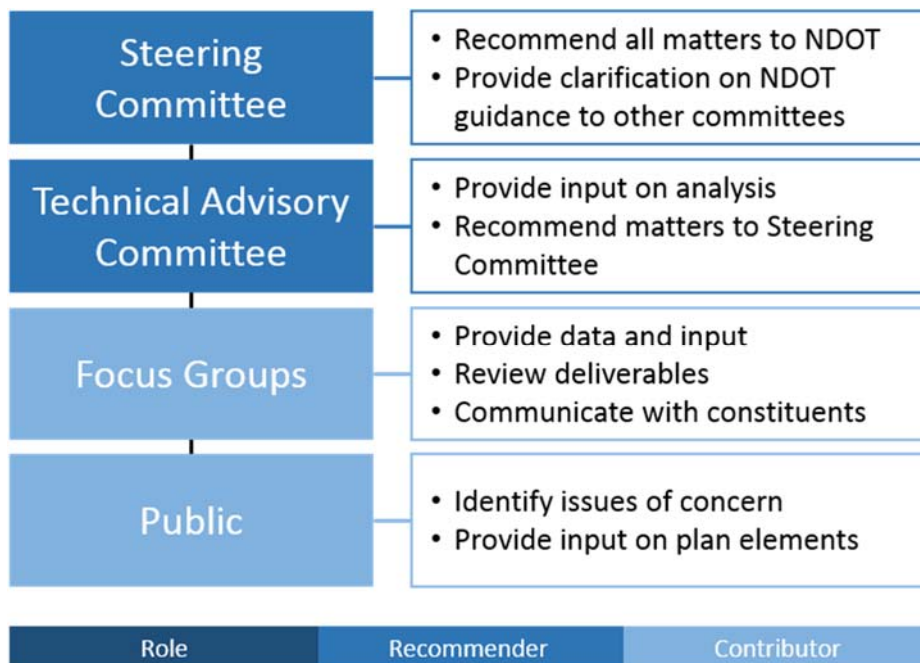
Figure 1: One Nevada Plan Stakeholder Structure and Responsibilities

The One Nevada Transportation Plan will be advised by a multi-tiered committee structure comprised of partner agencies and other stakeholders to both provide high-level oversight and visioning, as well as continuous coordination and collaboration. The committees described herein and illustrated on Figure 1 will streamline decision-making, while at the same time enable the team to gather input from a wide variety of interests. Each committee is described in the following sections, paired with coordination roles and responsibilities.